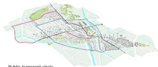
Public transport circle