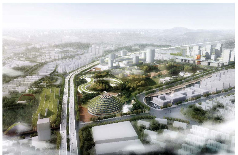
Four Vibrant Communities