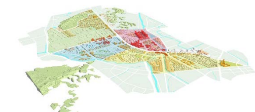
Taishan vibrant new village