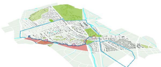
Landscape and open space