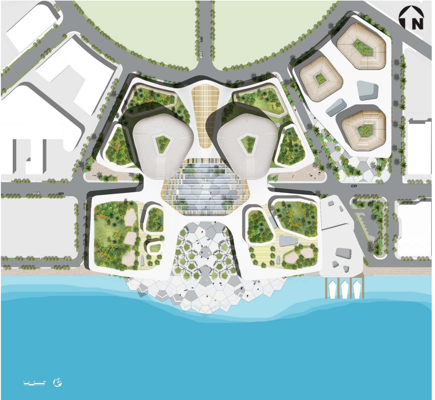
Project Master Plan 场地总图