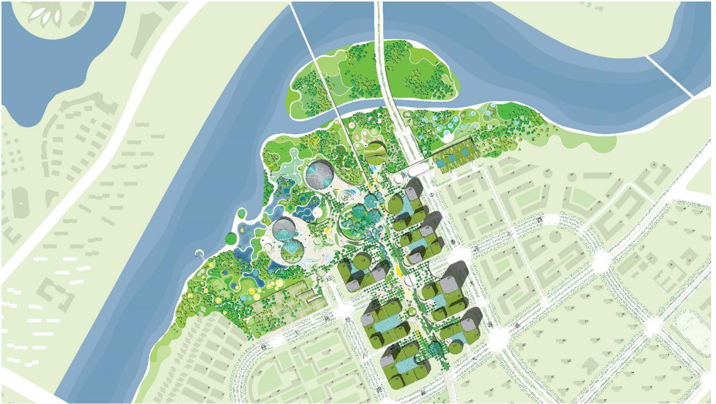
Project Master Plan