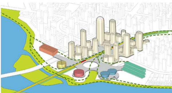
Form & Corridor