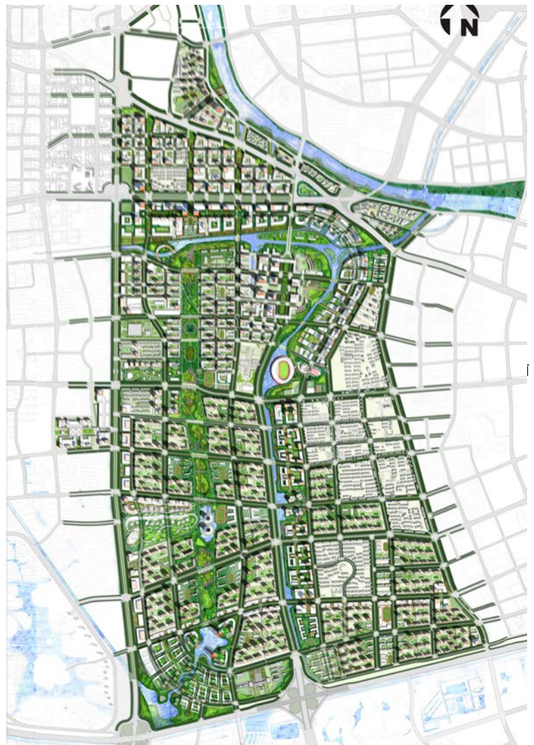
Project Master Plan