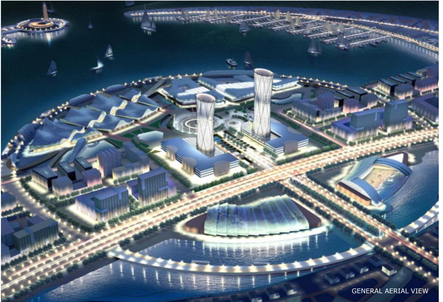
GENERAL AERIAL VIEW