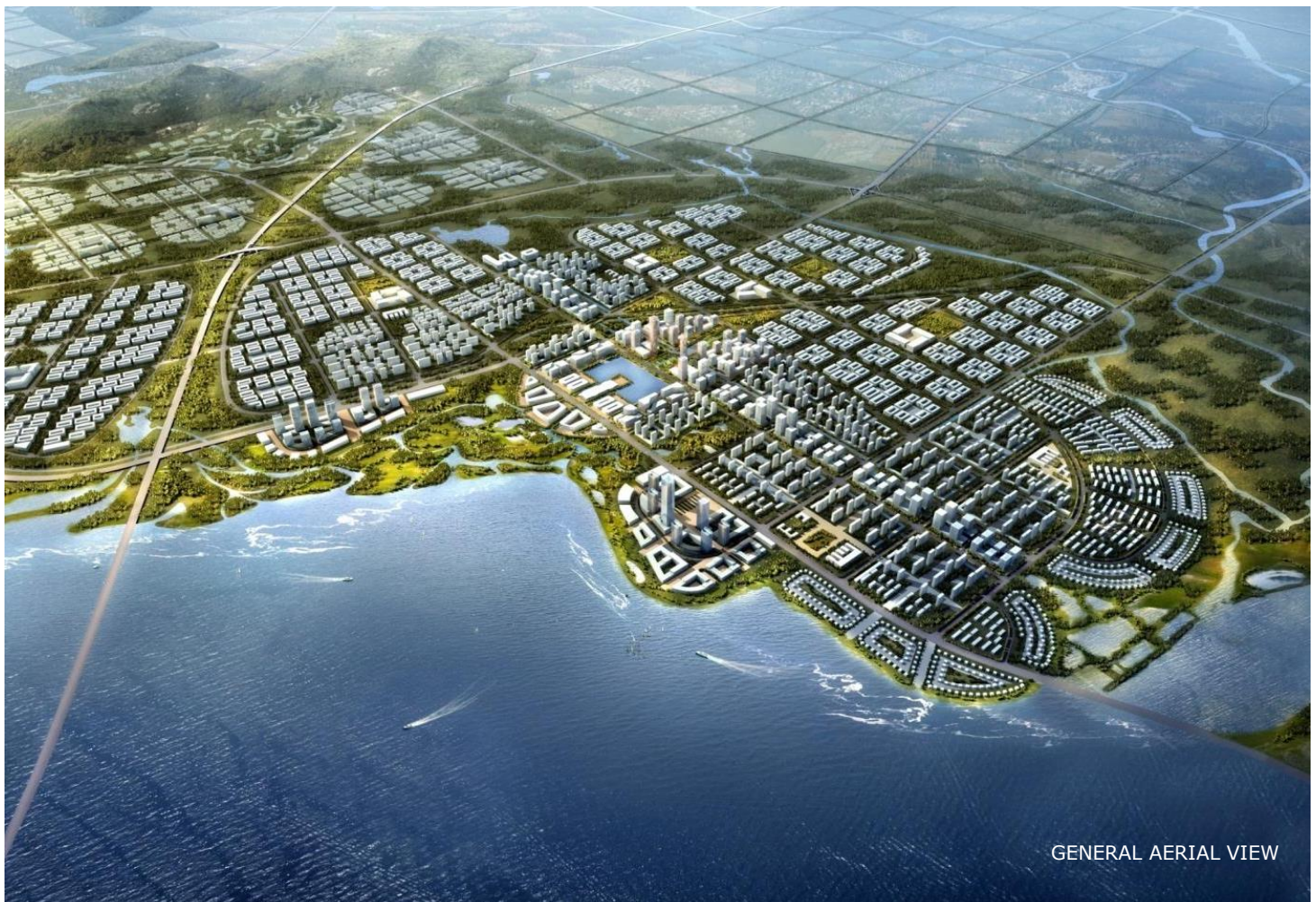
GENERAL AERIAL VIEW