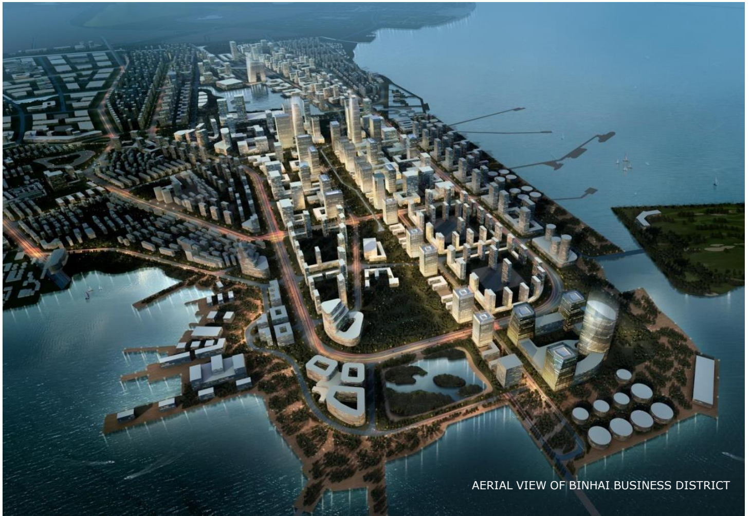
AERIAL VIEW OF BINHAI BUSINESS DISTRICT