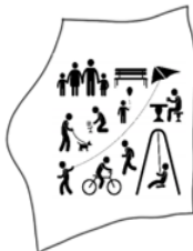
VITALITY AND VITALITY ORIENTED OUTDOOR SPACE