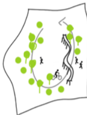
SHELTER OF OUTDOOR PUBLIC CORRIDOR IN RAINY SEASON