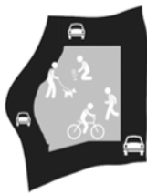
PERIPHERAL MOTOR TRAFFIC, INTERNAL PEDESTRIAN TRAFFIC