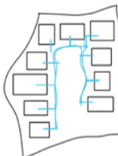
SPONGE RAINWATER COLLECTION GARDEN