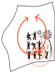
THE DRIVING FORCE OF CULTURAL ENGINE ON THE WHOLE