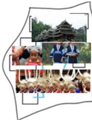
RICH NATURAL AND CULTURAL RESOURCES