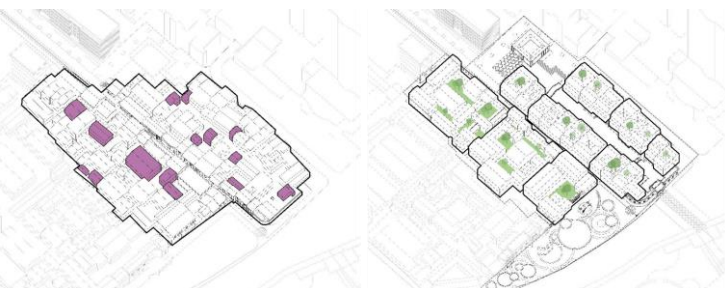
INTEGRATE BUILDING SPACES AND COURTYARDS