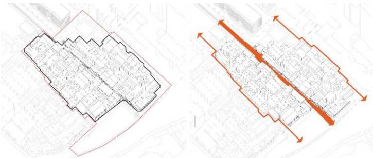
PRESERVE AND LOCK THE STREET OUTLINE